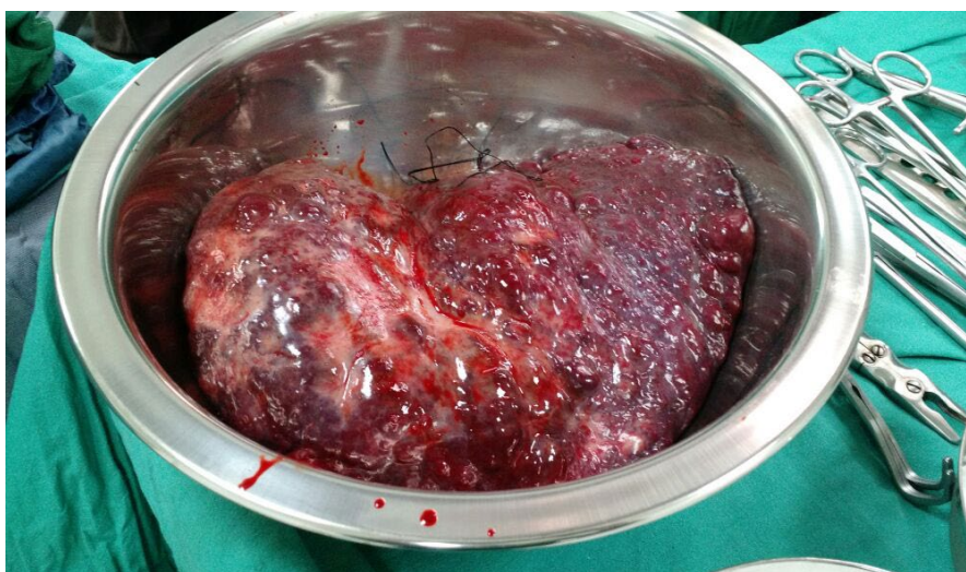
Figure 3. Specimen